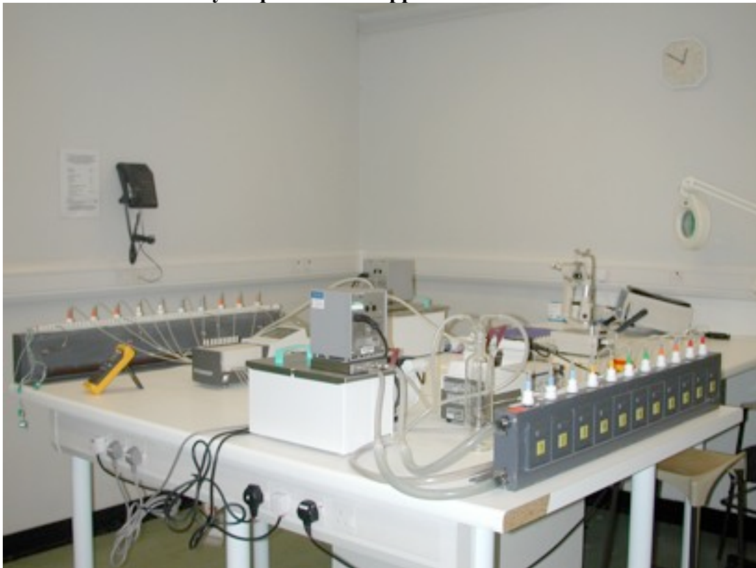
Figure F-1 Isolated Rabbit Eye Equilibration Apparatus